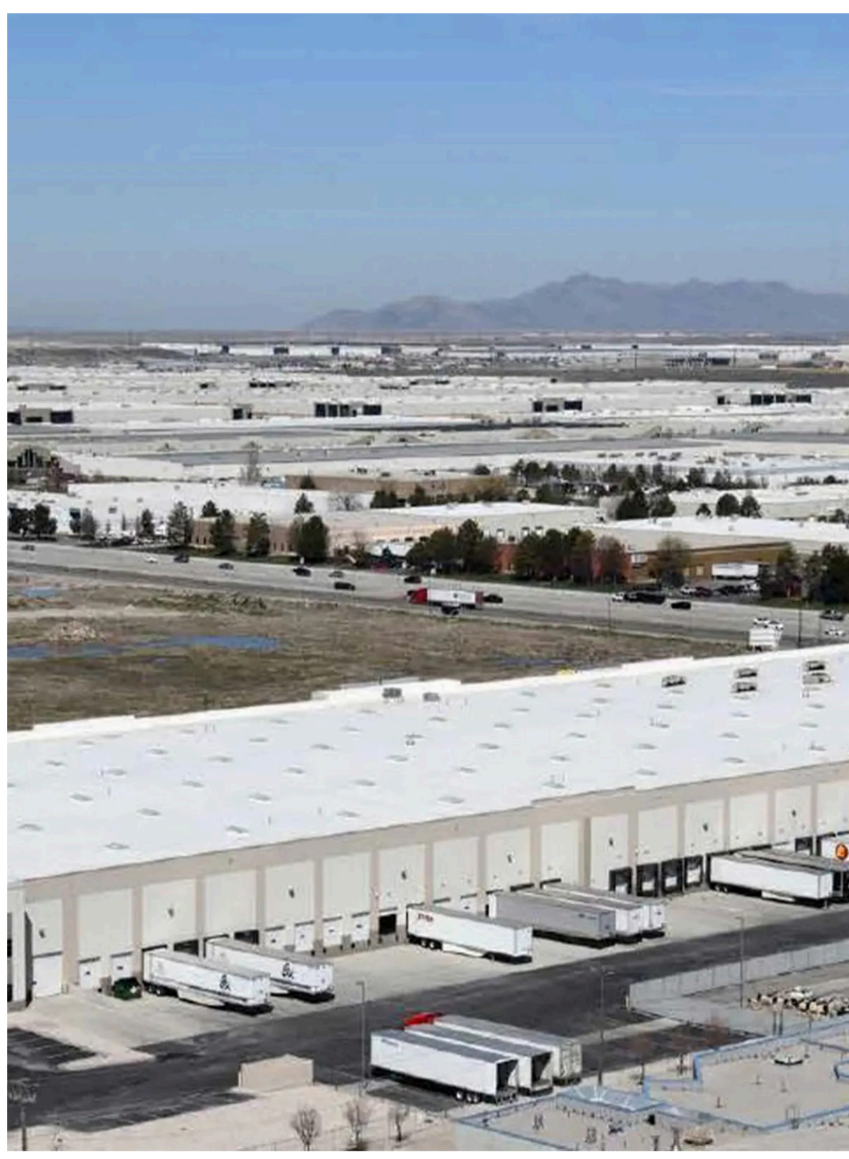
CBRE National Partners brokered the deal in emerging U.S. industrial market