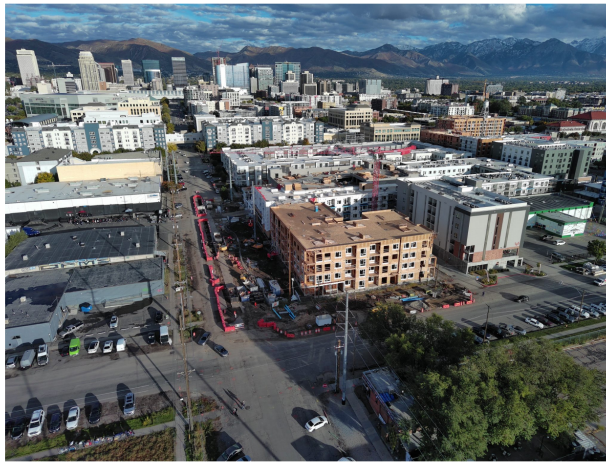
The Depot District, also known as the Gateway District, stretches from 400 West to I-15 (~700 West), and North Temple to 400 South. Its history as a transportation hub on the west side of Downtown is still apparent today. But its recent emergence into a mixed-use, dense urban neighborhood is unmistakable.