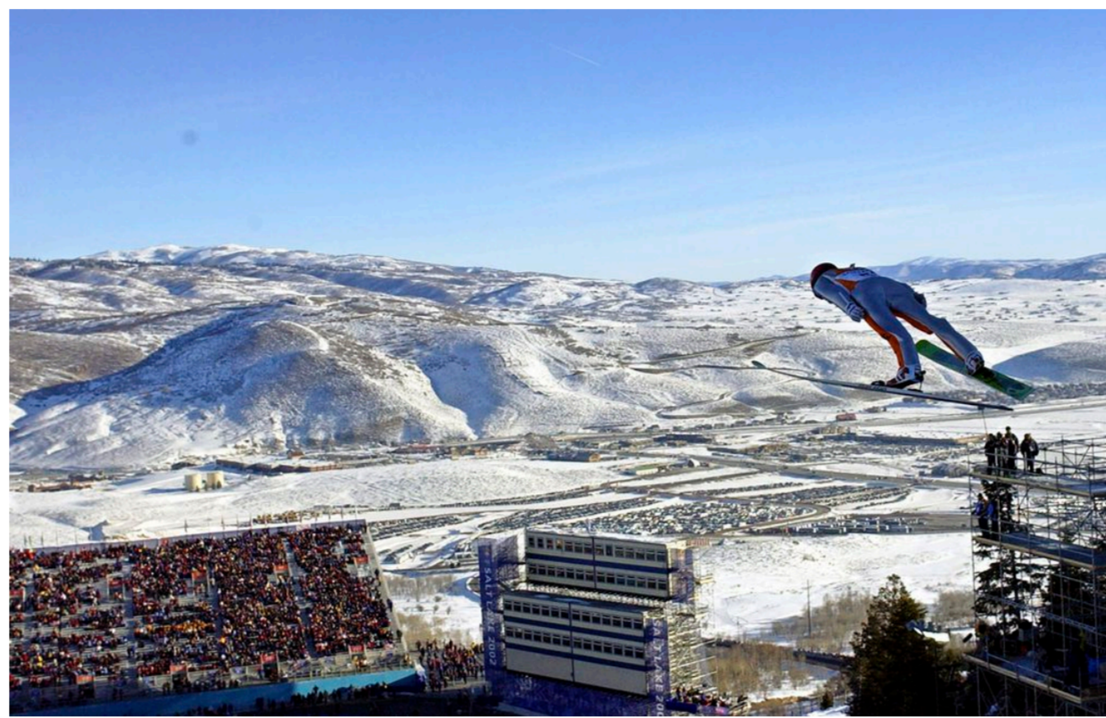
A big-air skiing ramp in Pioneer Park. A ski mountaineering course at City Creek Park. Medals ceremonies and concerts inside an MLB stadium. Some of those venues, and indeed some of those events, didn't exist when Utah hosted the 2002 Olympics. Some of the facilities still don't exist.