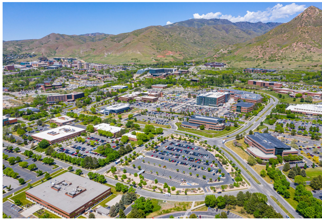
The University of Utah has selected a group of partners to help build and manage 5,000 new student beds on campus.