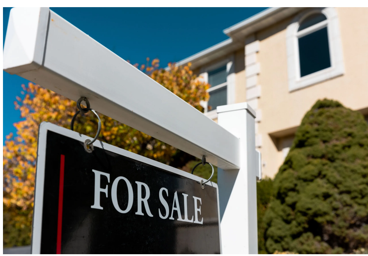
A "For sale" sign in front of a home in North Salt Lake on Oct. 30, 2023. The National Association of Realtors and two codendants were ordered to pay nearly $1.8 billion in damages to about a half a million home sellers after a federal jury found they had conspired to artificially inflate commissions paid to real estate agents.