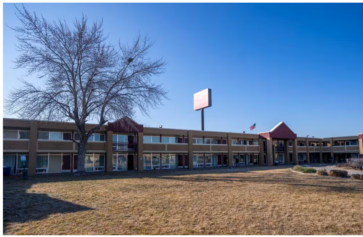
The Ramada Inn on North Temple in Salt Lake City on Monday, January 31, 2022. The Larry H. Miller Co. is looking to take over the site, which failed to become a permanent supportive housing development, in a deal that would give it a prime lot near its proposed location for a Major League Baseball stadium.