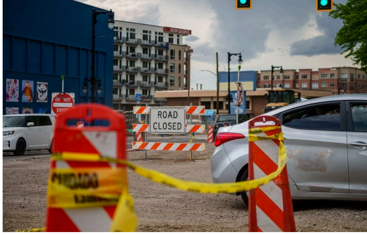
A stretch near Sugar House Park will be under construction starting in September.