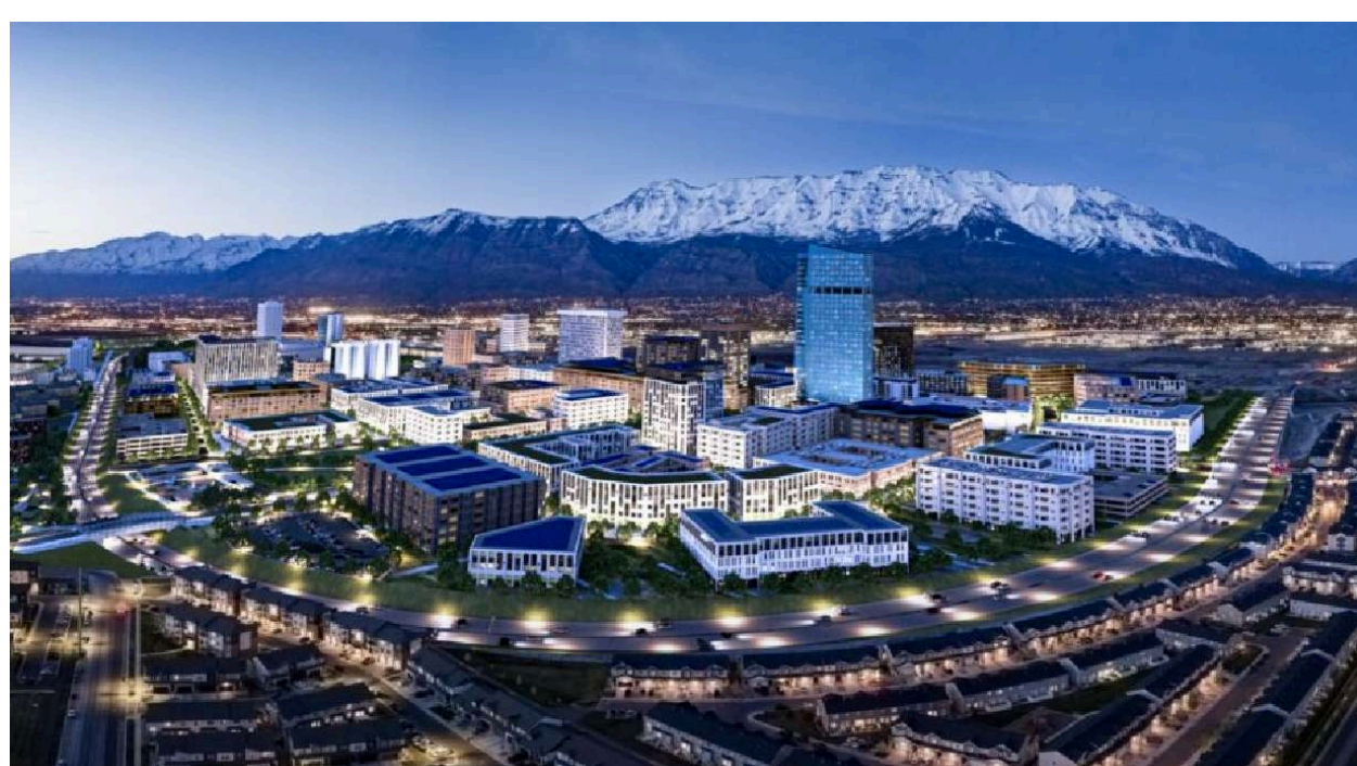
At over 700 acres, Utah City is poised to be 100 acres larger than The Point in Draper.