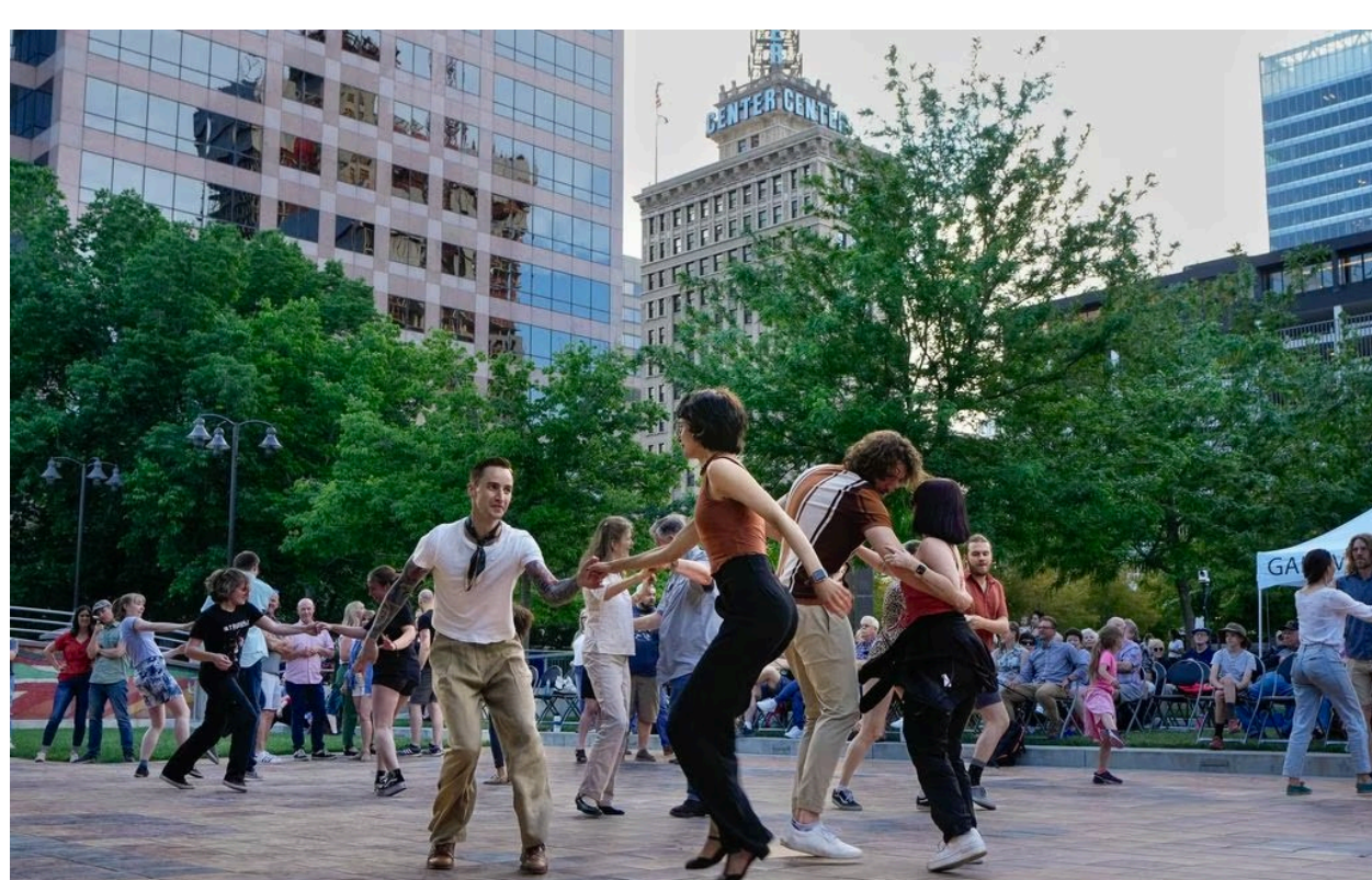
An SLC developer told the New York Times Utah's capital city is just a handful of years behind the Texas capital.