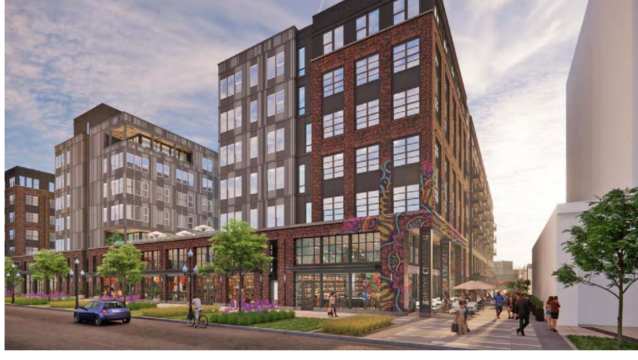
After years of delay and the acquisition of a neighboring property, J. Fisher Companies has rewritten its plans for a significant Downtown site at 250 S. 200 E.