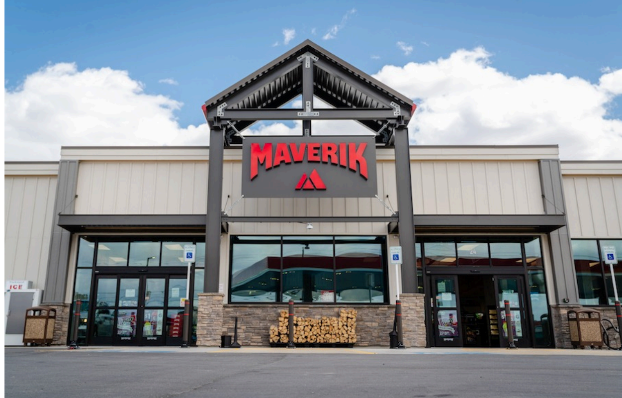
The acquisition effectively doubles Maverik's portfolio to more than 14,000 employees and 800 locations in 20 states, making it the 12th-largest convenience store chain in the country. Maverik CEO Chuck Maggelet will oversee the new combined organization.