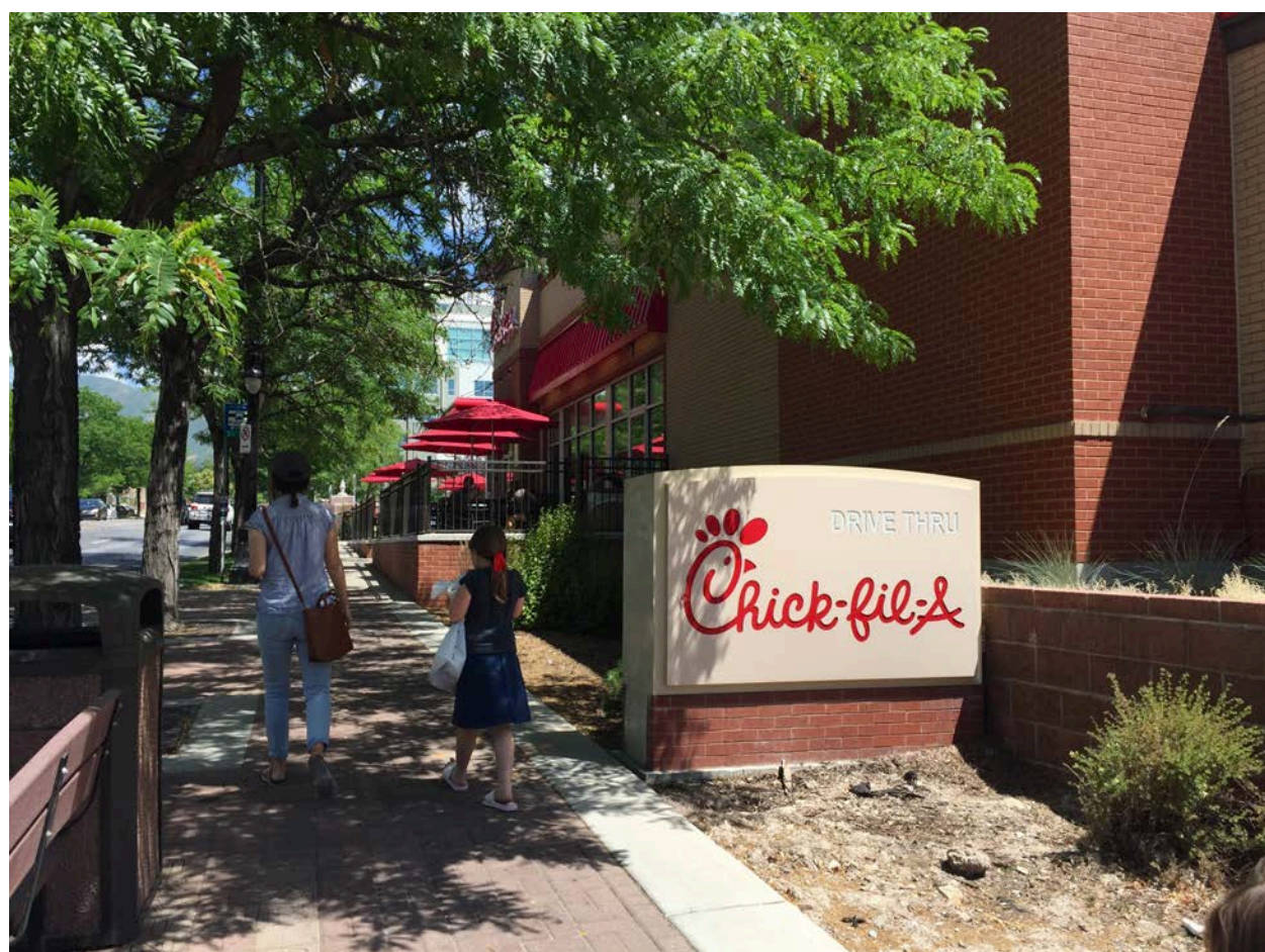
The council also voted to remove the permitted use designations for all drive-thru facilities in the Sugar House business district — CSHBD1 and CSHBD2.