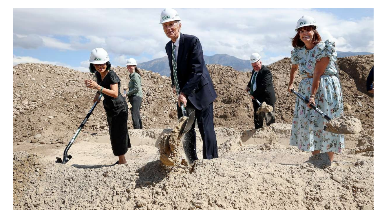
Much like Utah County itself, Utah Valley University is experiencing rapid growth.

Utah Valley University breaks ground on new $88M engineering and technology building