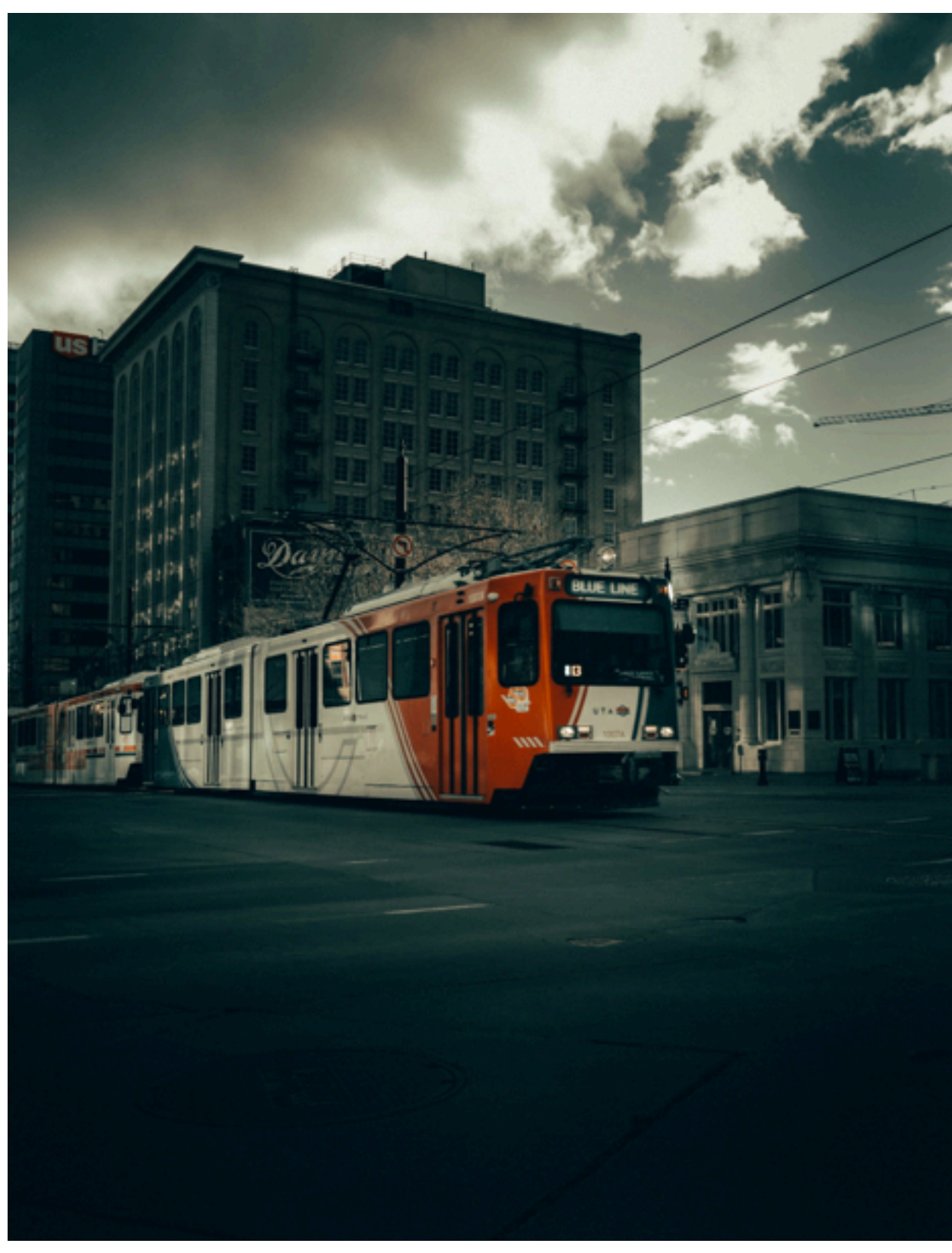
U.S. News analyzed the 150 most populous metro areas to find the best places to live. To make the top of the list, a place had to have good value, be a desirable place to live, and have a strong job market and a high quality of life.