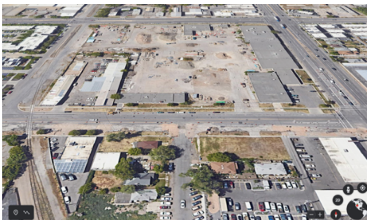
It's been over 12 years since Salt Lake City moved its fleet operations out of the Granary District.