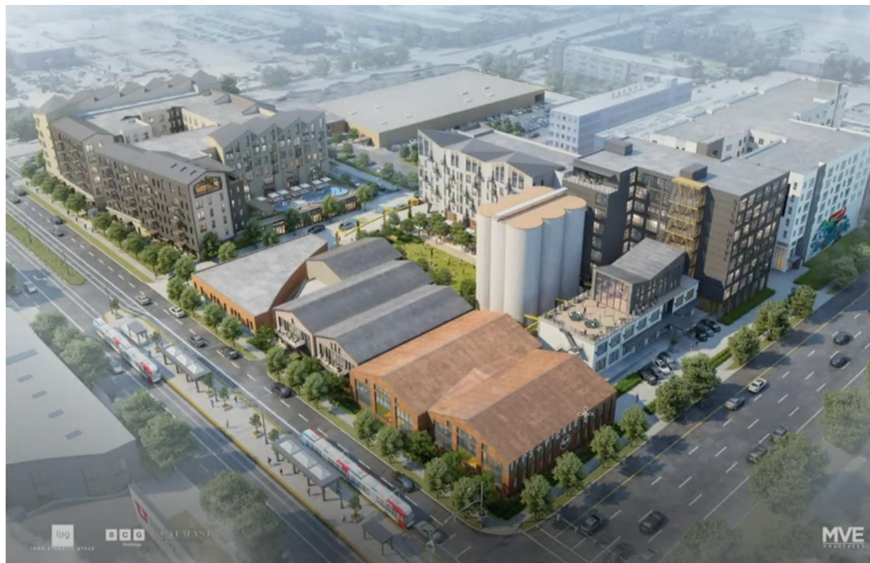
A project that would add 286 apartments plus space for retail and commercial immediately west of the Post District got the go-ahead from the Planning Commission on Wednesday night.