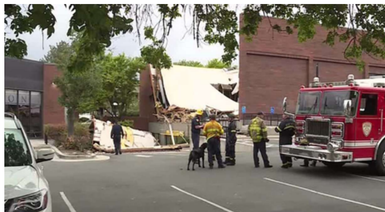
According to Unified Fire Authority, the end unit in the commercial building was under renovation and a construction crew was inside as the roof fell on top of them. The workers were able to escape without major injury.