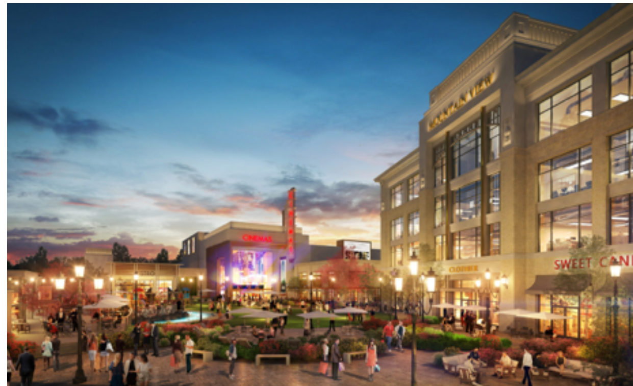
The sprawling 85-acre, mixed-use development is located in the heart of Silicon Slopes. Its aesthetic and diverse amenities draw a young workforce, allowing tenants to offer an unmatched employee experience.