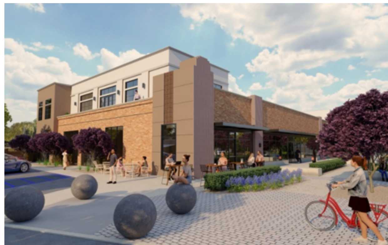
The developer who purchased the Southeast Market building on the north end of the Liberty Wells neighborhood has released plans for what she's calling the "Milk Block."