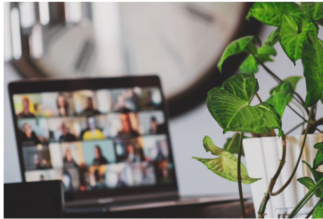
While not everyone relished Zooming from the kitchen table, it's clear the pandemic's work-from-home experience sparked a conversation about how companies approach the workplace.