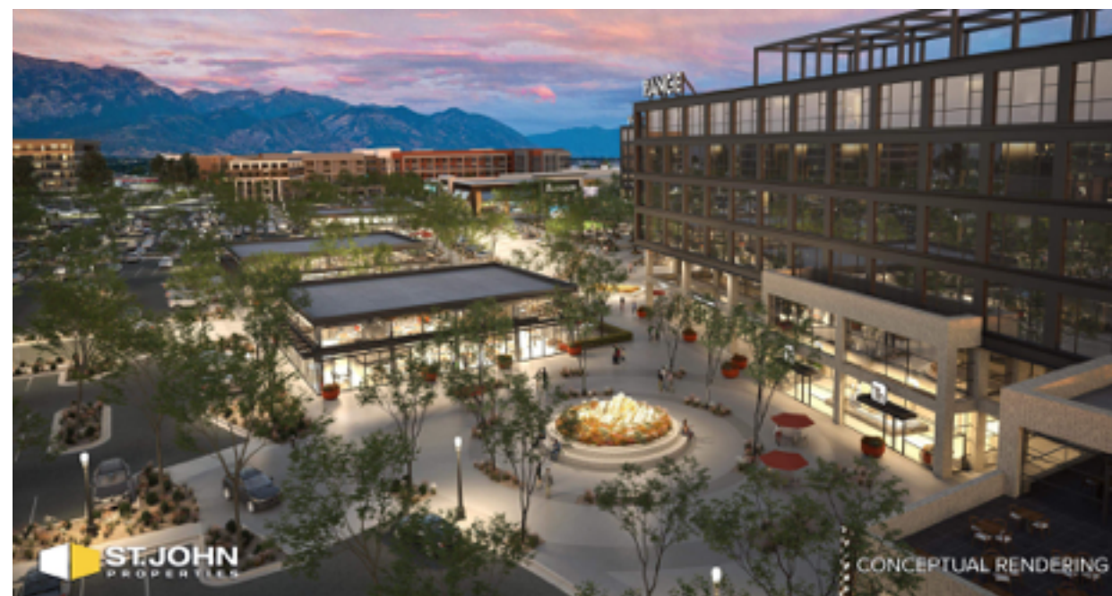
Development of new phase will bring St. John Properties' commercial investment to over $1.2 billion in Pleasant Grove