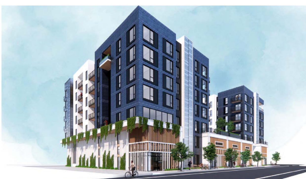
1365 S. Jefferson in Salt Lake City's Ballpark neighborhood. Renderings by Arch Nexus