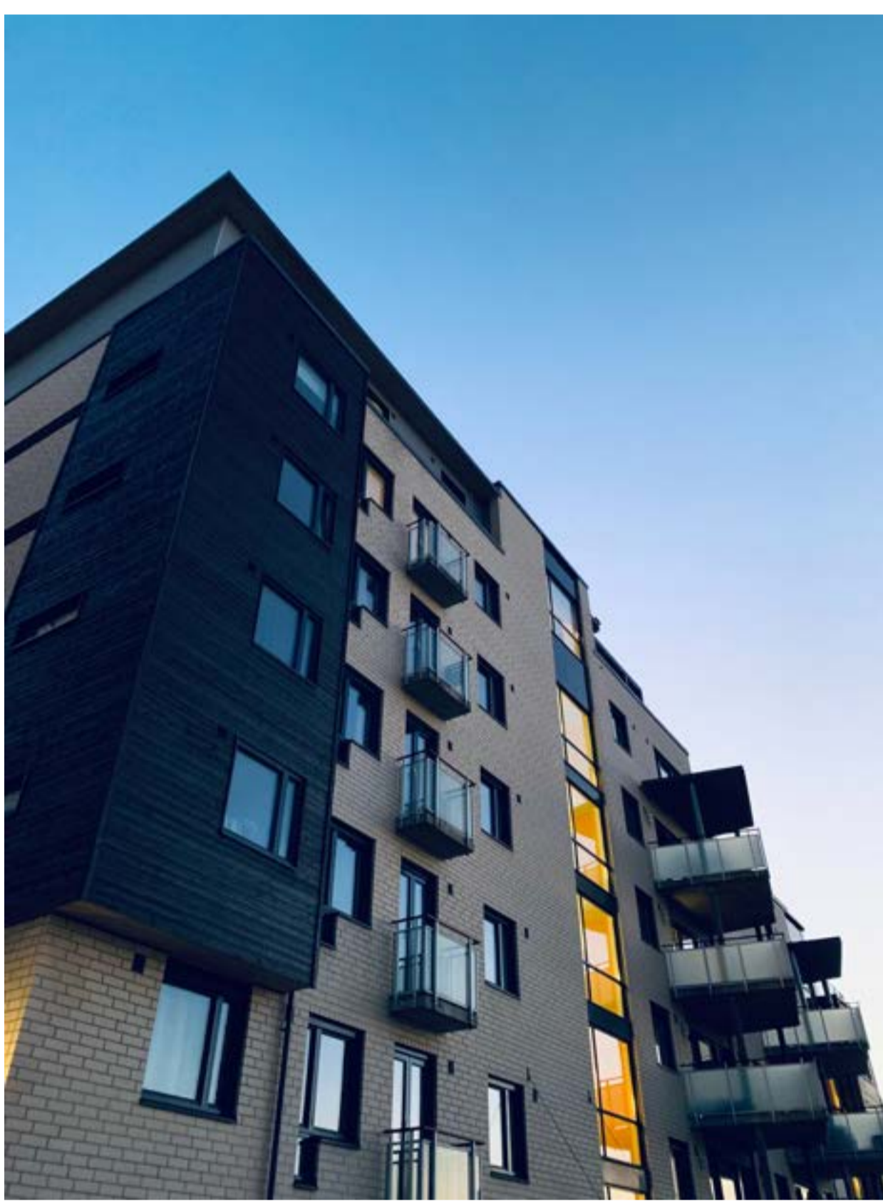
Supporters say bill could help lower costs for housing, but detractors worry new entity would lack elected officials