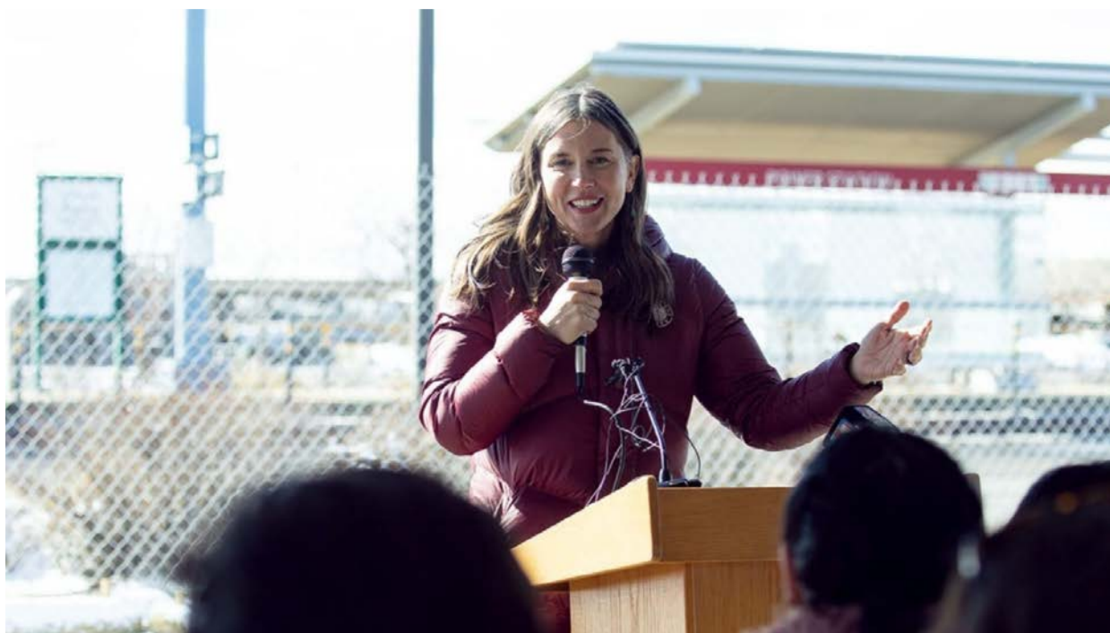
Salt Lake City Mayor Erin Mendenhall speaks during a groundbreaking for the Spark mixed-use development project Tuesday, Feb. 28, 2023.