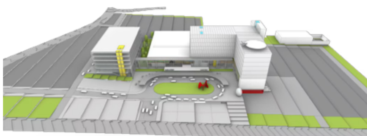
Concept rendering of U. West Valley Health and Hospital Center. The draft includes an ambulatory building and an inpatient tower and emergency room.