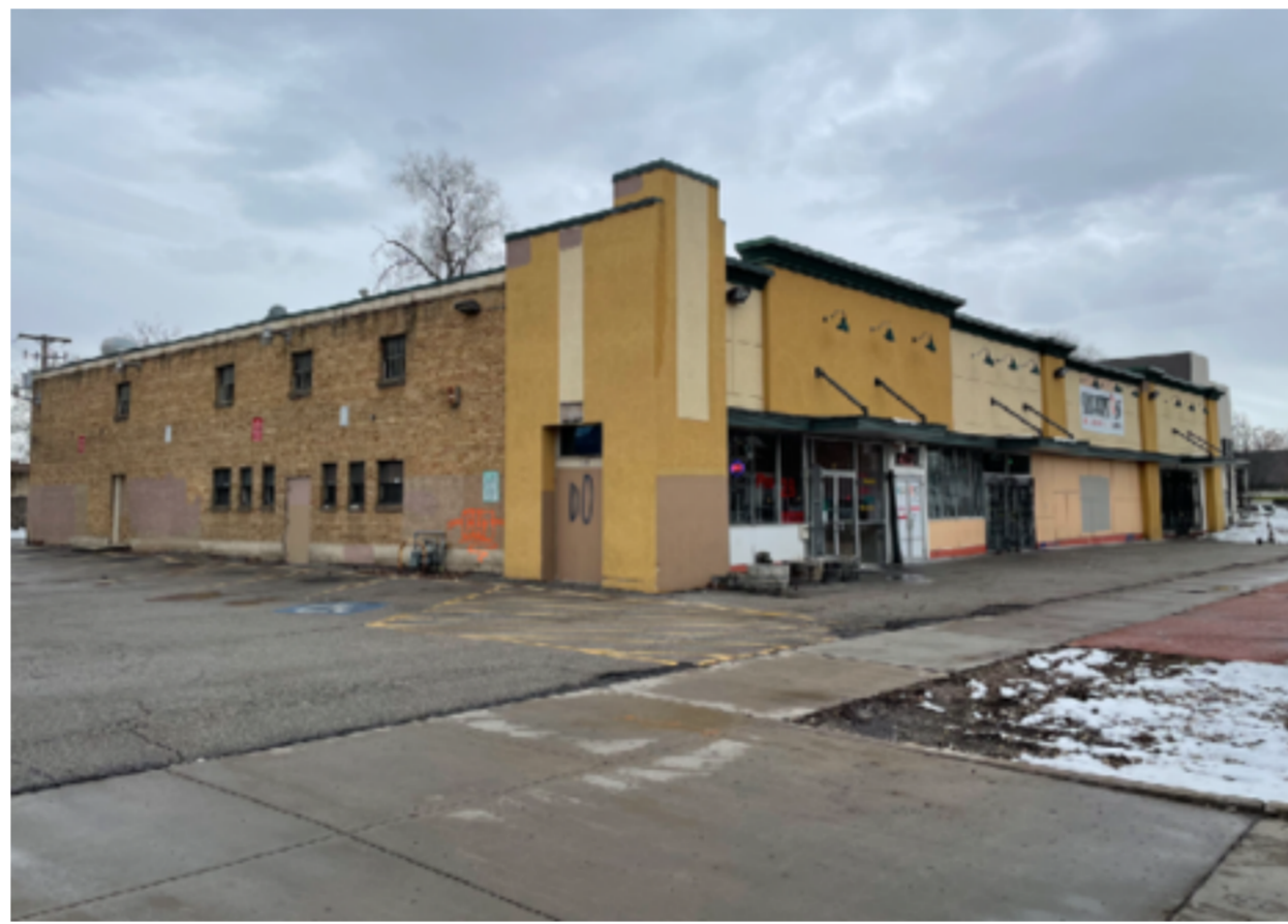
A longtime neighborhood grocery close to Liberty Park, since 1997 the Southeast Asian market, is getting a facelift instead of the wrecking ball.