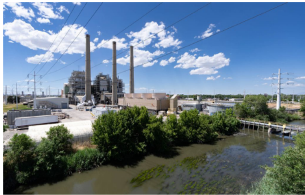
Property that Rocky Mountain Power is seeking a rezone along North Temple and west of the Jordan River, pictured on Wednesday, July 6, 2022. The energy company plans to build a new corporate headquarters, in "an inaugural development" in its strategy to redevelop 100 acres it owns there to create what's being called the Power District Campus.