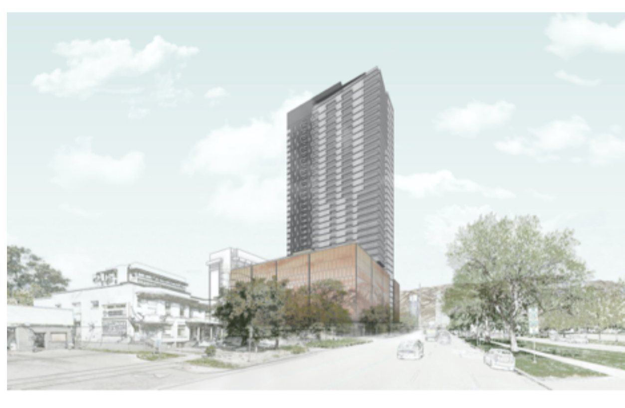
Other interesting details pop out of a conceptual site plan from the design review proposal recently submitted to the city by Denver-based McWhinney Real Estate Services, representing an Opportunity Zone fund registered in Delaware.