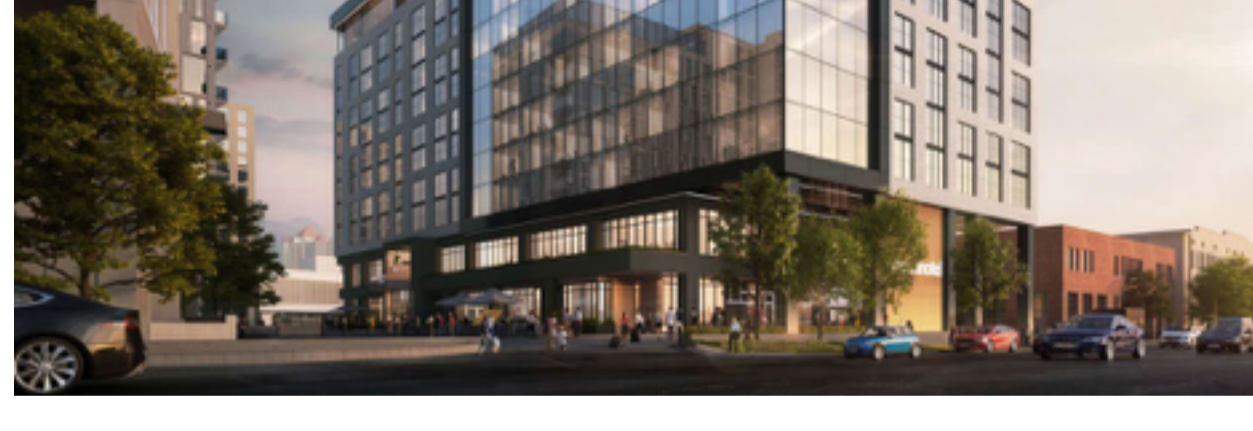
This is the first dual-pad property in Salt Lake City, as well as the first Le Meridien and Element combination of Marriott brands.

Dual-Branded Le Méridien and Element Salt Lake City Downtown to Open Mid-January 2023