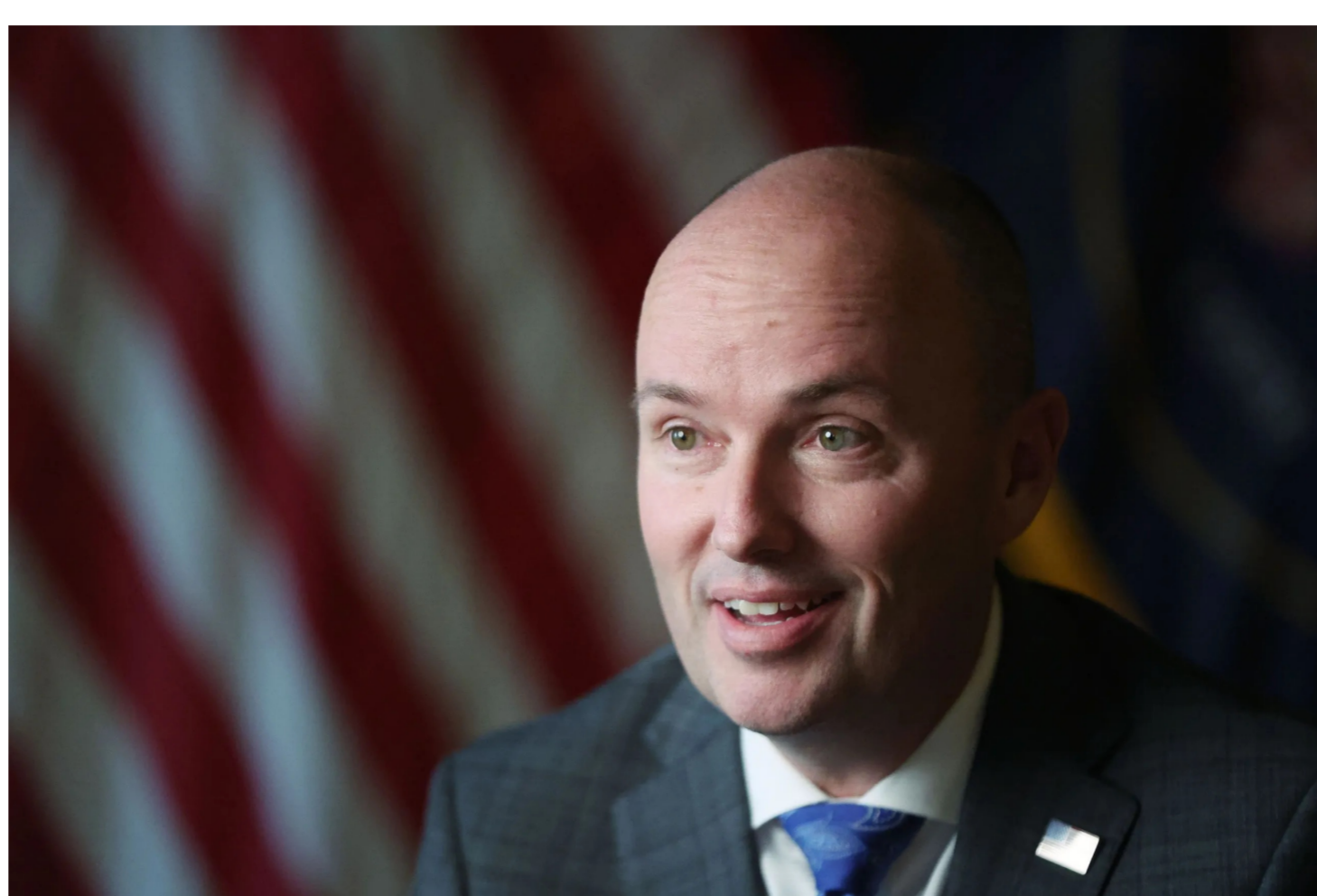
Housing market needs more supply to solve affordability crisis, so Utah leaders looking to break down barriers for development

Is Utah too developer friendly? No, Gov. Cox says. 'We need development. There is no other way'