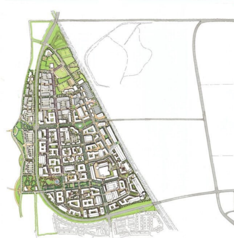
This rendering shows the planned 800-acre Vineyard Station development, which began buildout in September 2022.

Utah approves housing, transit zoning for Vineyard downtown plan