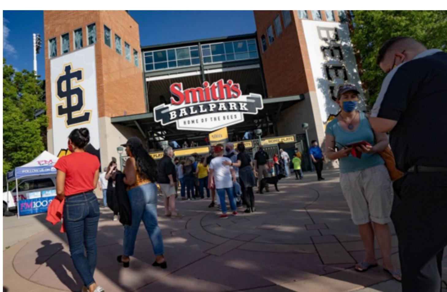
The team will play its final season in Salt Lake City in 2024 and debut a new stadium in 2025.

Bees leaving Utah's capital for South Jordan's Daybreak. What this may mean for SLC's Ballpark area.