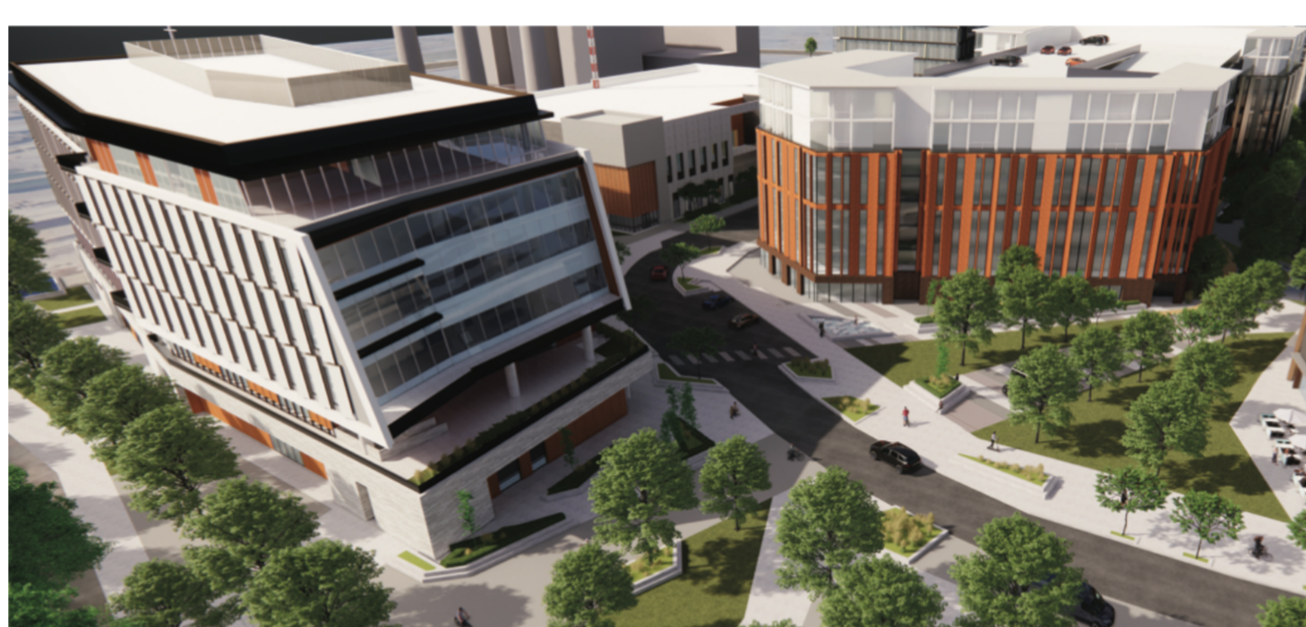
A rendering of the proposed redevelopment of Rocky Mountain Power's headquarters in Salt Lake City's Fairpark area. Ground could break on the project later this year.

Rocky Mountain Power provides update on proposed headquarters rezone