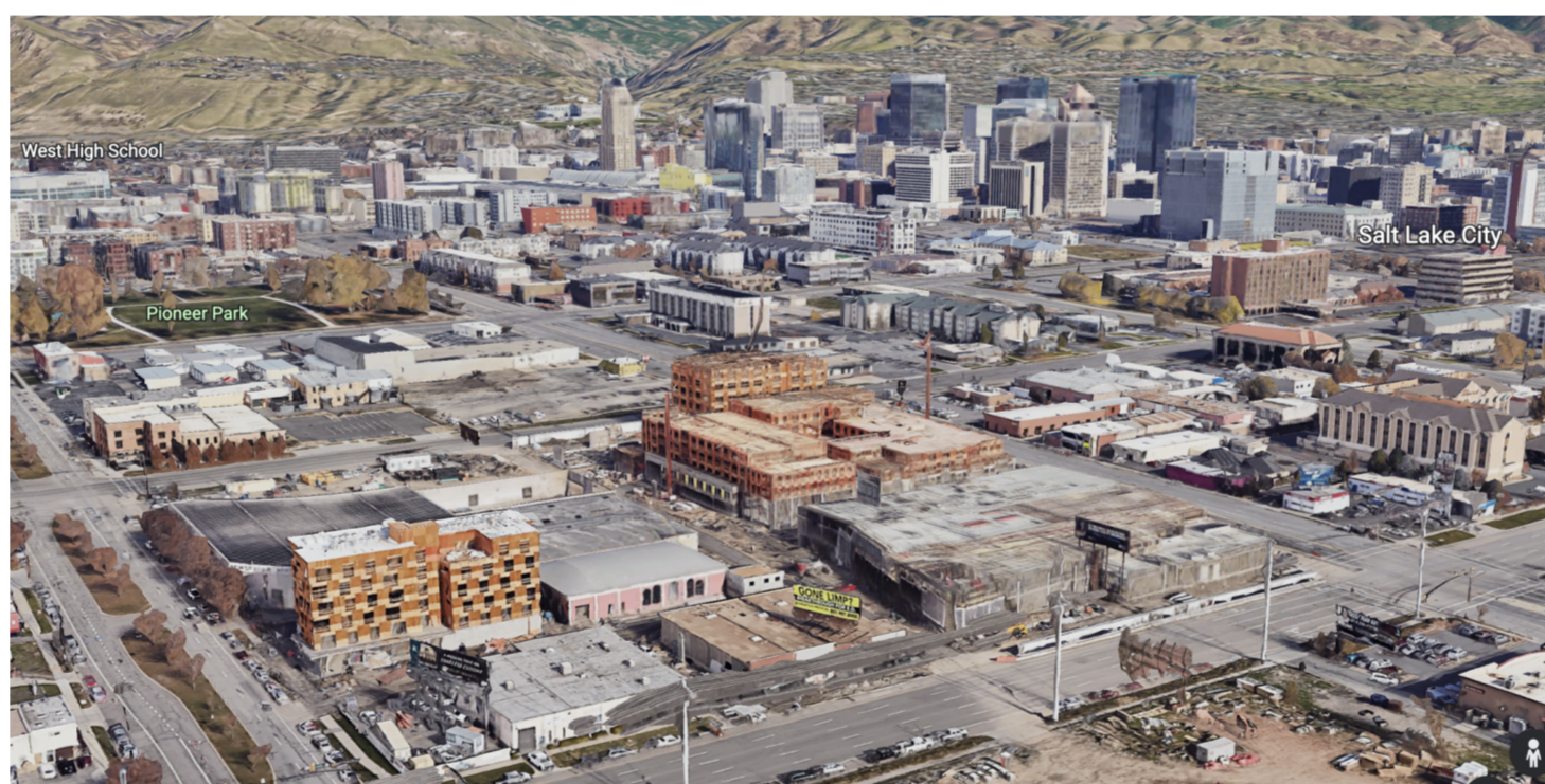
It's not quite the Granary, and it's not quite Downtown. But the teams responsible for developing a stretch between those two neighborhoods have quickly assembled a district that's on its way to standing alone in Salt Lake City.

Take a tour of the Post District, Salt Lake City's new mixed-use neighborhood