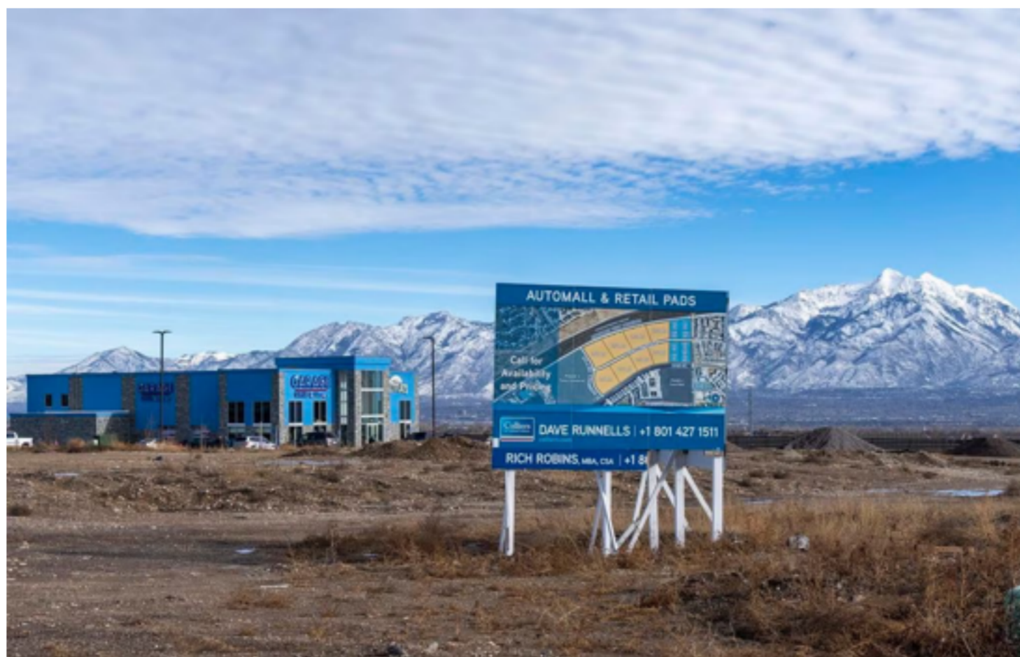
Auto mall expects to include dealerships for cars, boats and RVs, but is this project the best use for so much valuable space?

A big development is opening in Herriman this year. What will it feature?