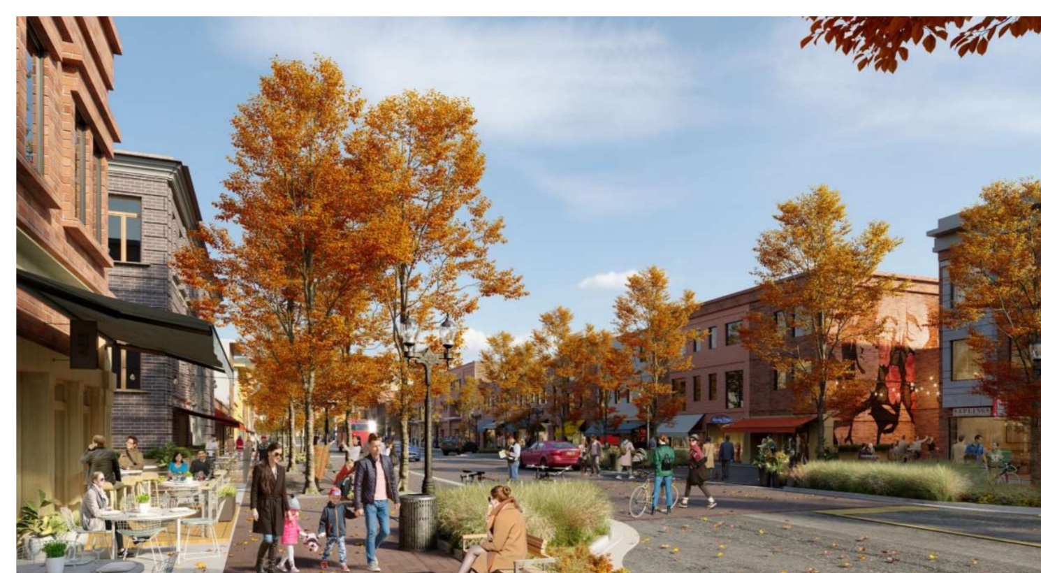
The WonderBlock is a five-acre redevelopment of the former Hostess factory on 26th Street that was demolished in 2018. It will include residential dwellings, retail, office services, food and beverage and hospitality, according to Ogden City's website.