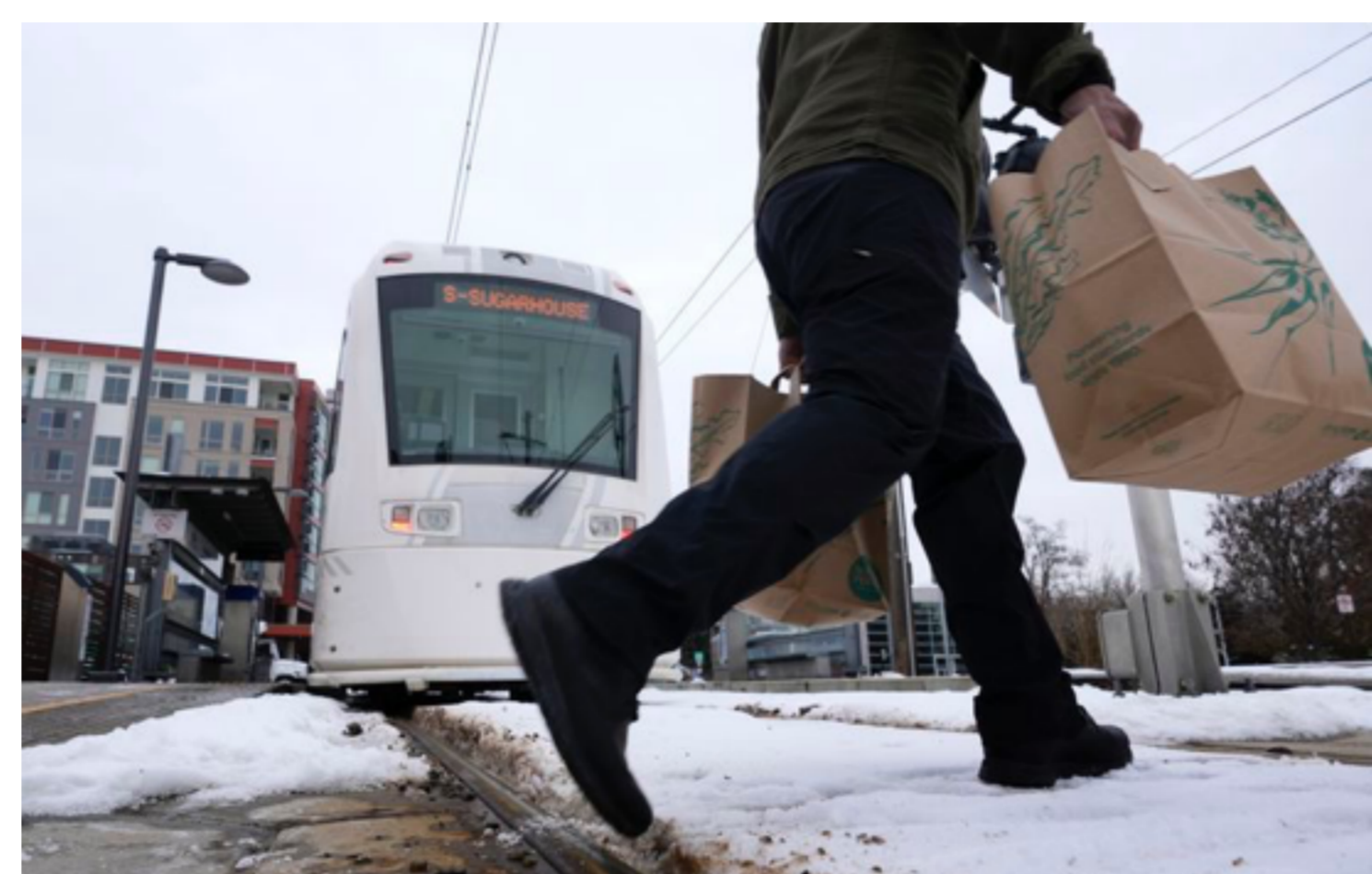
S-Line is driving big-time development, but is it easing traffic?