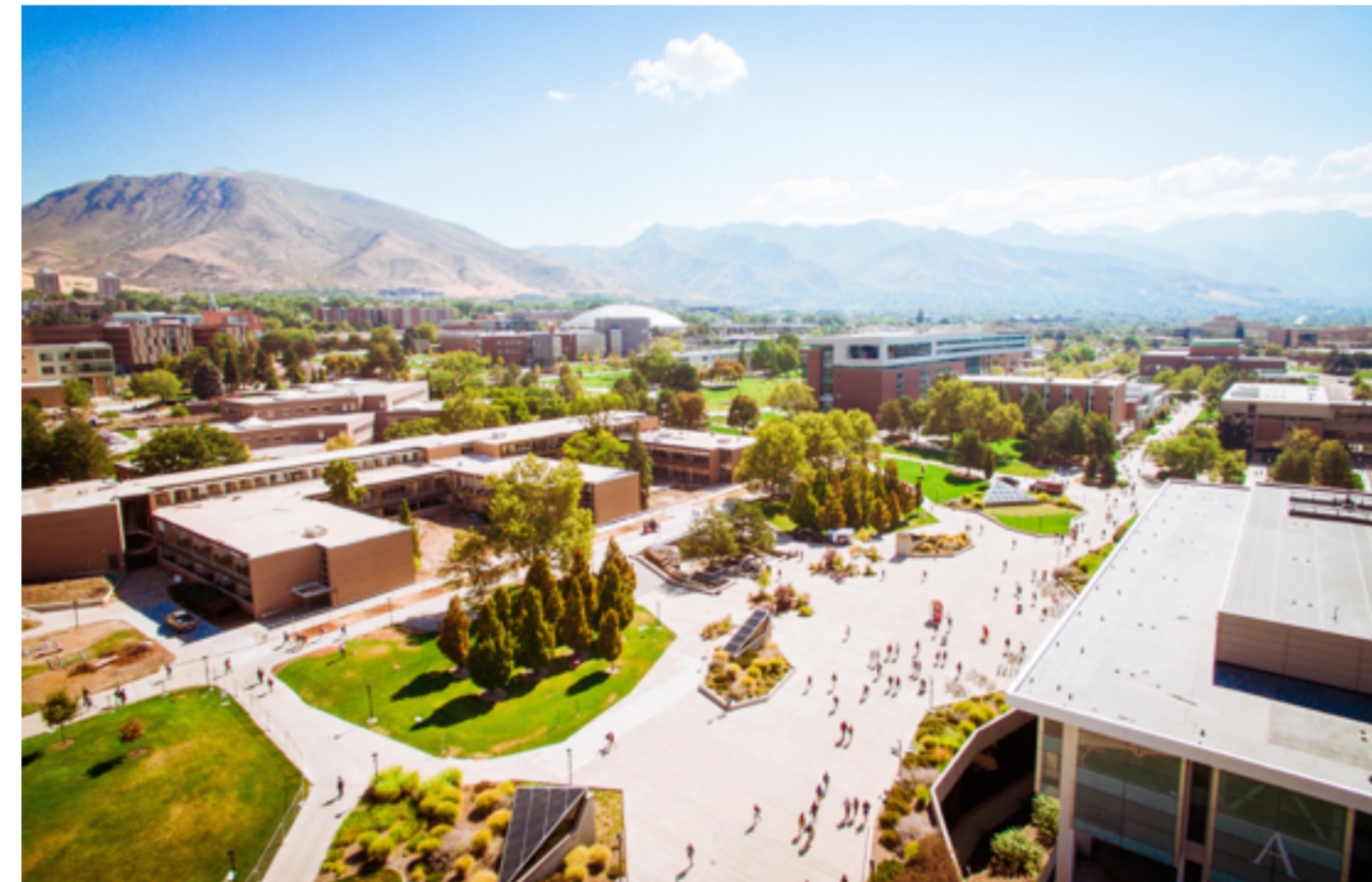
The University of Utah is embarking on an effort to transform its 170-year-old campus by doubling on-campus housing—adding 5,000 new student beds by 2030. To reach that goal, the university will launch a public-private partnership, also known as a P3, with a company that can design, finance, build and maintain the new student housing.