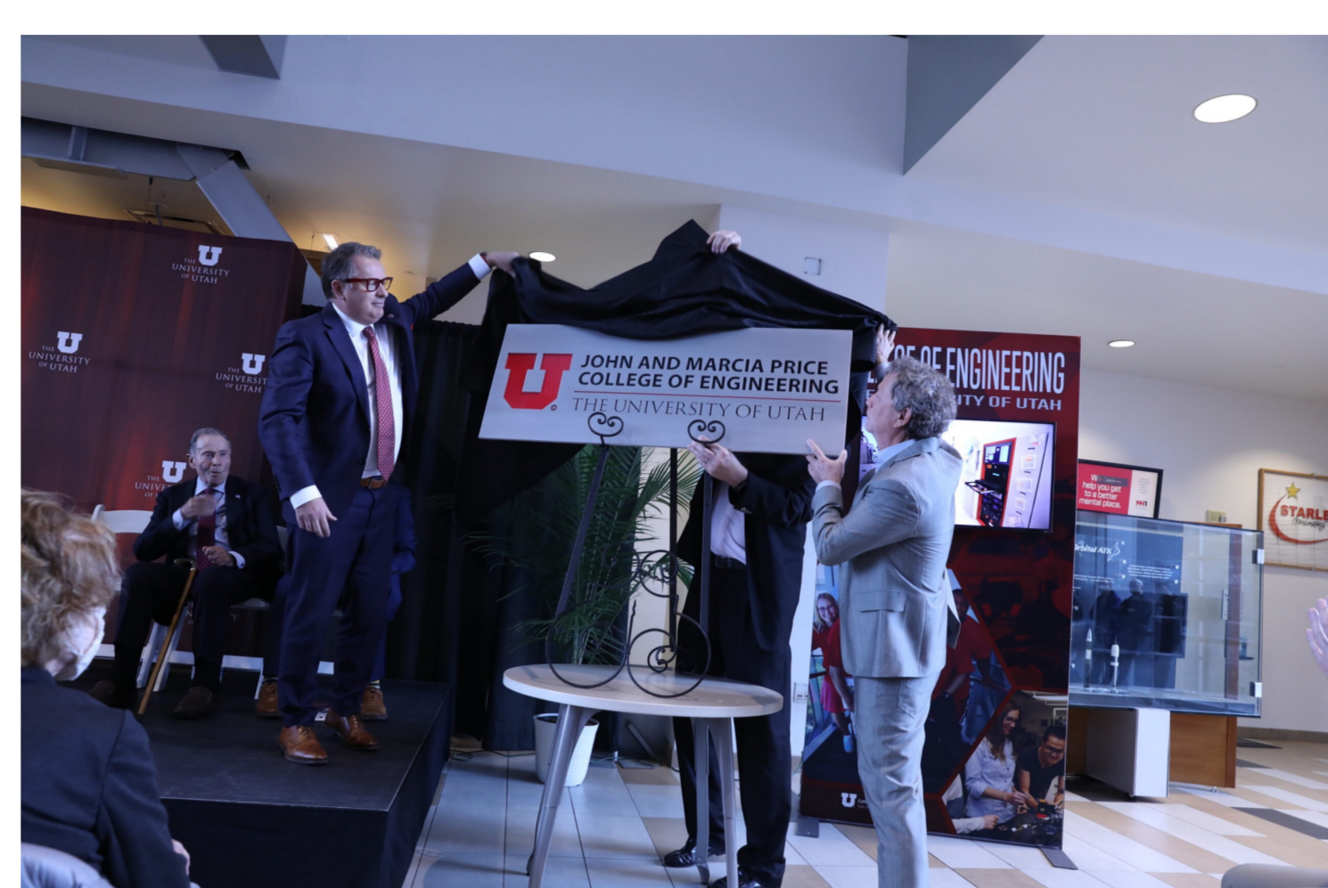
For 128 years, the University of Utah's College of Engineering has been the state's premier research and educational institution for engineering and computer science. Today, the college receives a major boost.