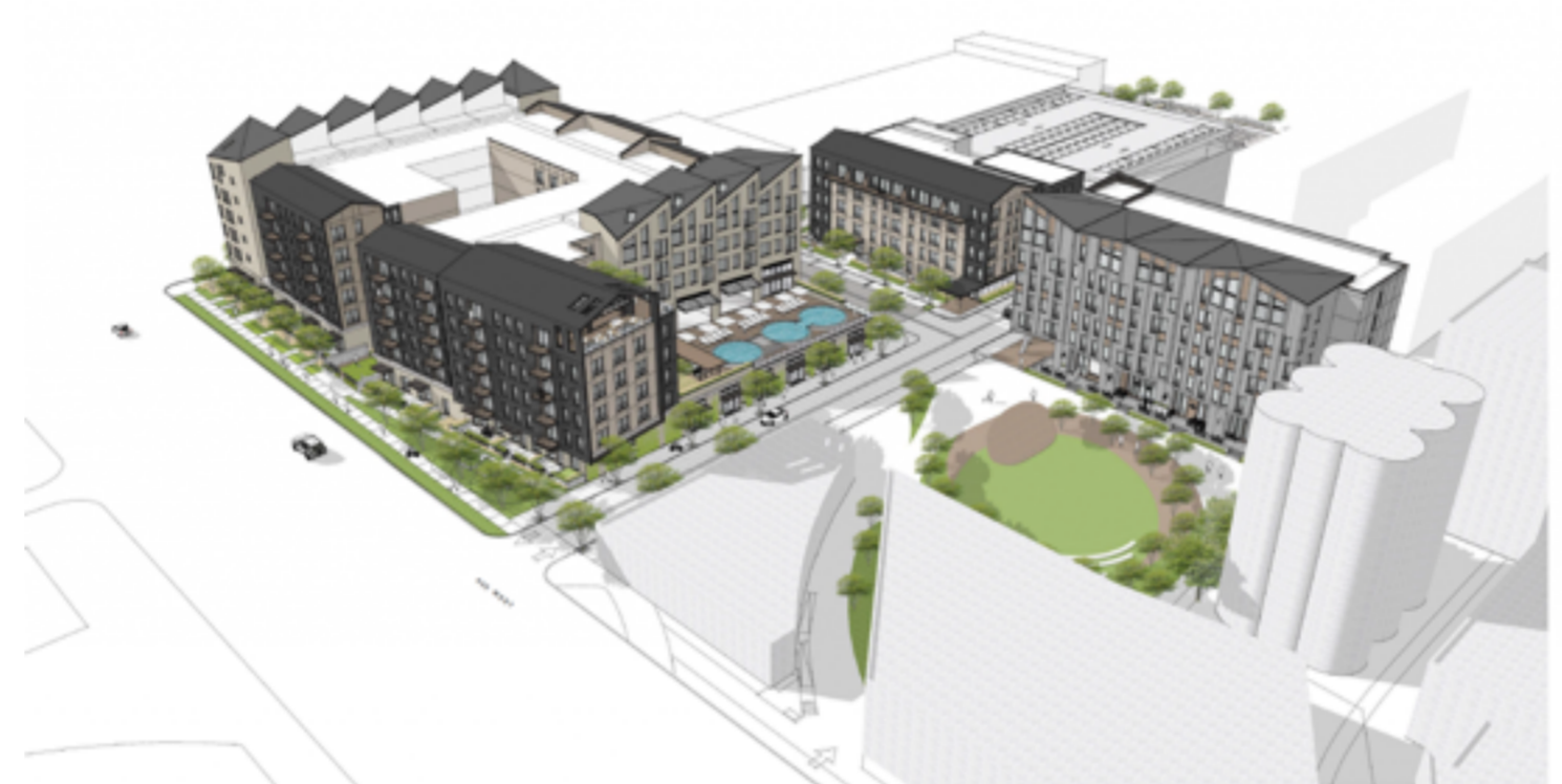
The developers behind the Post District expanding their footprint to the west have released new details for a proposal called the Silos.